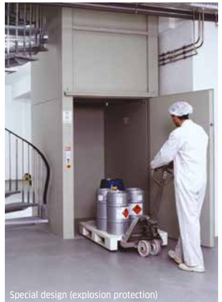
Special design (explosion protection)